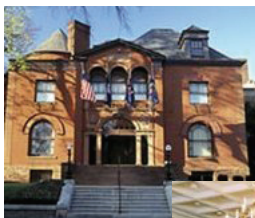
Richmond's historic Commonwealth Club—site of our 75th Anniversary Southern Supper.